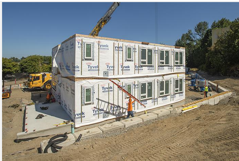
The first four modular boxes comprise one of the three buildings in the Low Income Single Adult Housing project in North Portland.

Tagged with: HOLST ARCHITECTURE HOUSING DEVELOPMENT CENTER LISAH MODS PDX TRANSITION PROJECTS WALSH