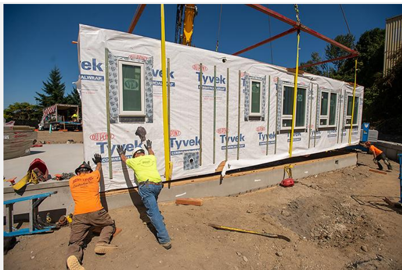
Crews set a modular unit in place atop a foundation.