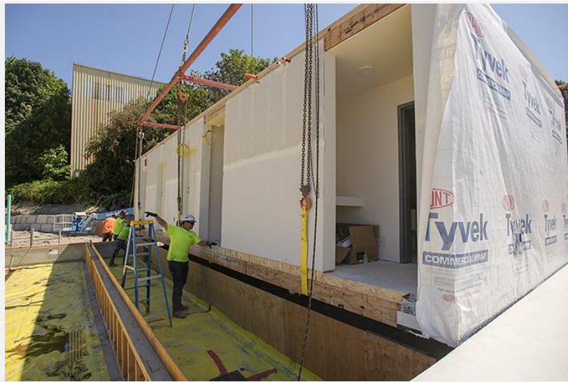
Cody Humphrey helps guide a modular unit into place atop a foundation.