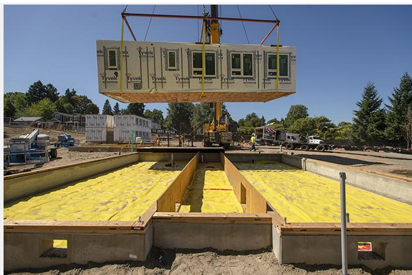
The first of four modular boxes comprising an entire building is flown into place atop a concrete foundation at the LISAH project site.

“It’s much more of a team-driven experience,” he said. “You really want to bring everybody together in the very beginning to talk about what we call ship loose, or items that are left to be done on the site; so we’re working very closely with Walsh to make sure there is good continuity from both subcontracting and material bases.”