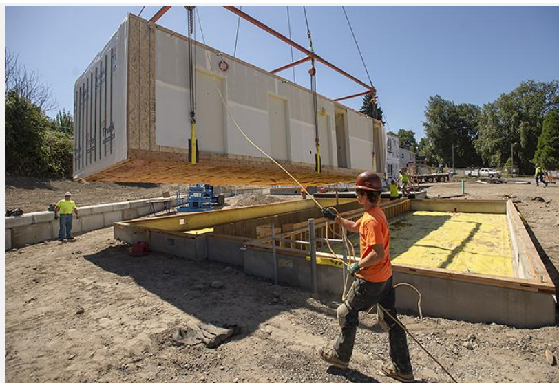
Bent Level Construction employee Brody Humphrey helps guide a modular box into place at the LISAH affordable housing development in North Portland.