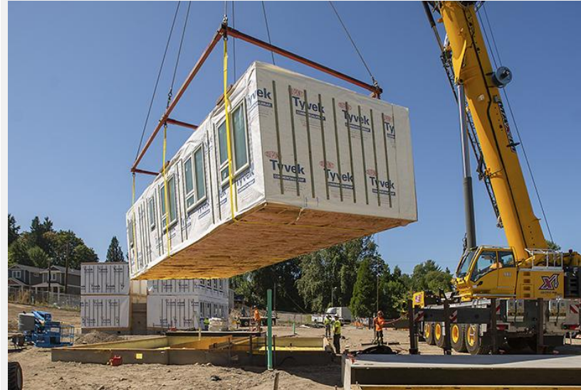
The first of four modular boxes is flown into place atop a concrete foundation at the LISAH project site.

By: Josh Kulla in Scrolling Box September 13, 2019 2:31 pm