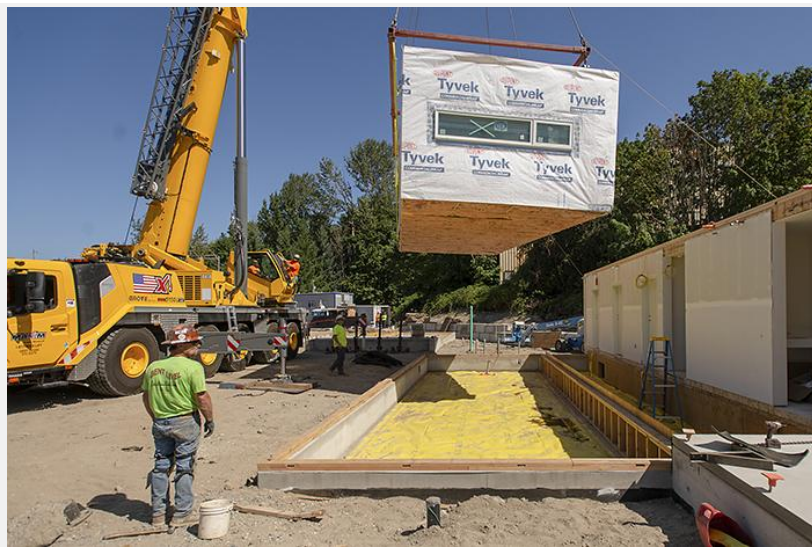
A modular unit is flown into place at the LISAH project site in North Portland.