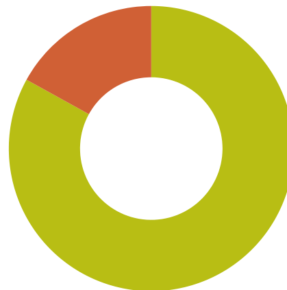
Administration and Fundraising 17%